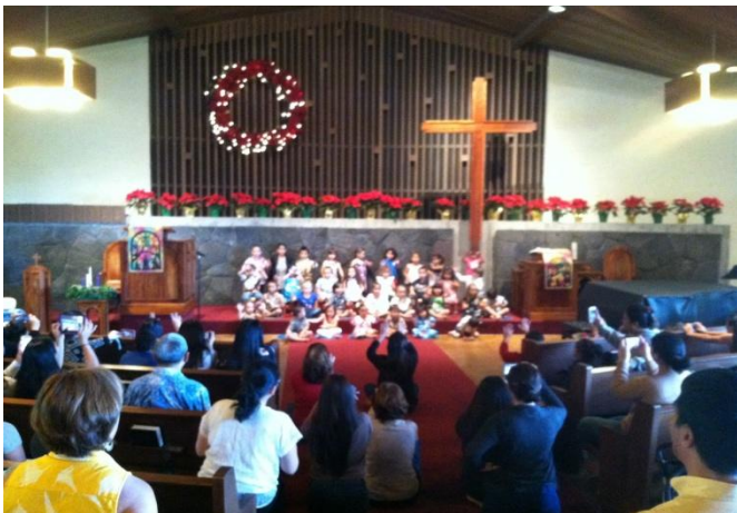
Kamehameha Pre-School Program

Thank you to all who contributed in any way to the celebrations and gatherings, from decorating to baking, from cleaning to performing. Your gift was wonderful and very much appreciated!!