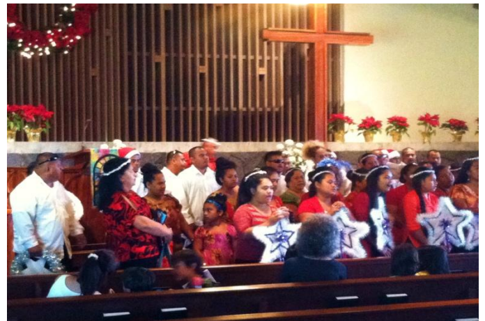
Kosraean Christmas Celebration